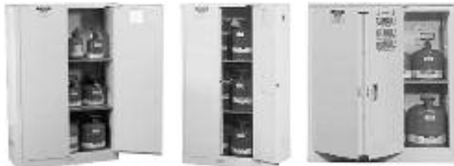
2 door, manual-close

cabinets shown w/product, sold separately