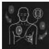
Visual cues prompt pad placement