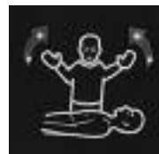
Stand clear of the patient